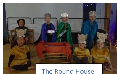
The Round House