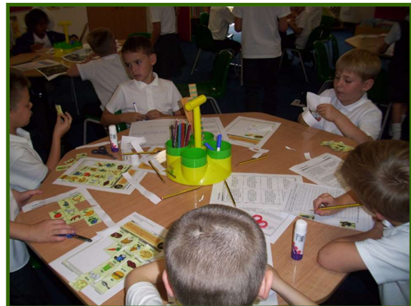
Fun finding out information in Ice Zone 2