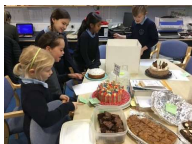
Cakes & colouring at The Round House for Children in Need

Our school communities have been actively fundraising this term, both for the benefit of our children's education and for others in need, near and far. PTAs have organised a series of fun activities for children and parents including Movie Nights, Christmas Fairs, and bake sales. At Murrow a Bingo Night raised £700 for the school to improve the playground.