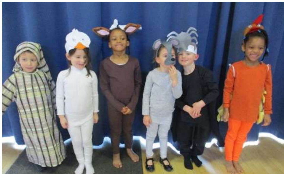
'Away in a Manger', Reception at Wintringham Primary Academy

Wishing all the children, parents, staff, volunteers and Governors at all our Diamond Learning Partnership Trust schools a very Merry Christmas and a Happy New Year!