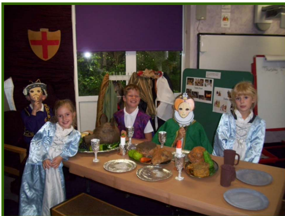
A Tudor Feast in Ice Zone 1!

Our Intensive Curriculum Experience or ICE zones are working really well in school, where children are supported in a variety of art, design and role play activities, to enhance and complement their topic learning in class.