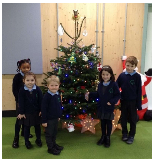
Handmade decorations at Wintringham Primary Academy

Wishing you a Merry Christmas and a Happy New Year from everyone at the Diamond Learning Partnership Trust!